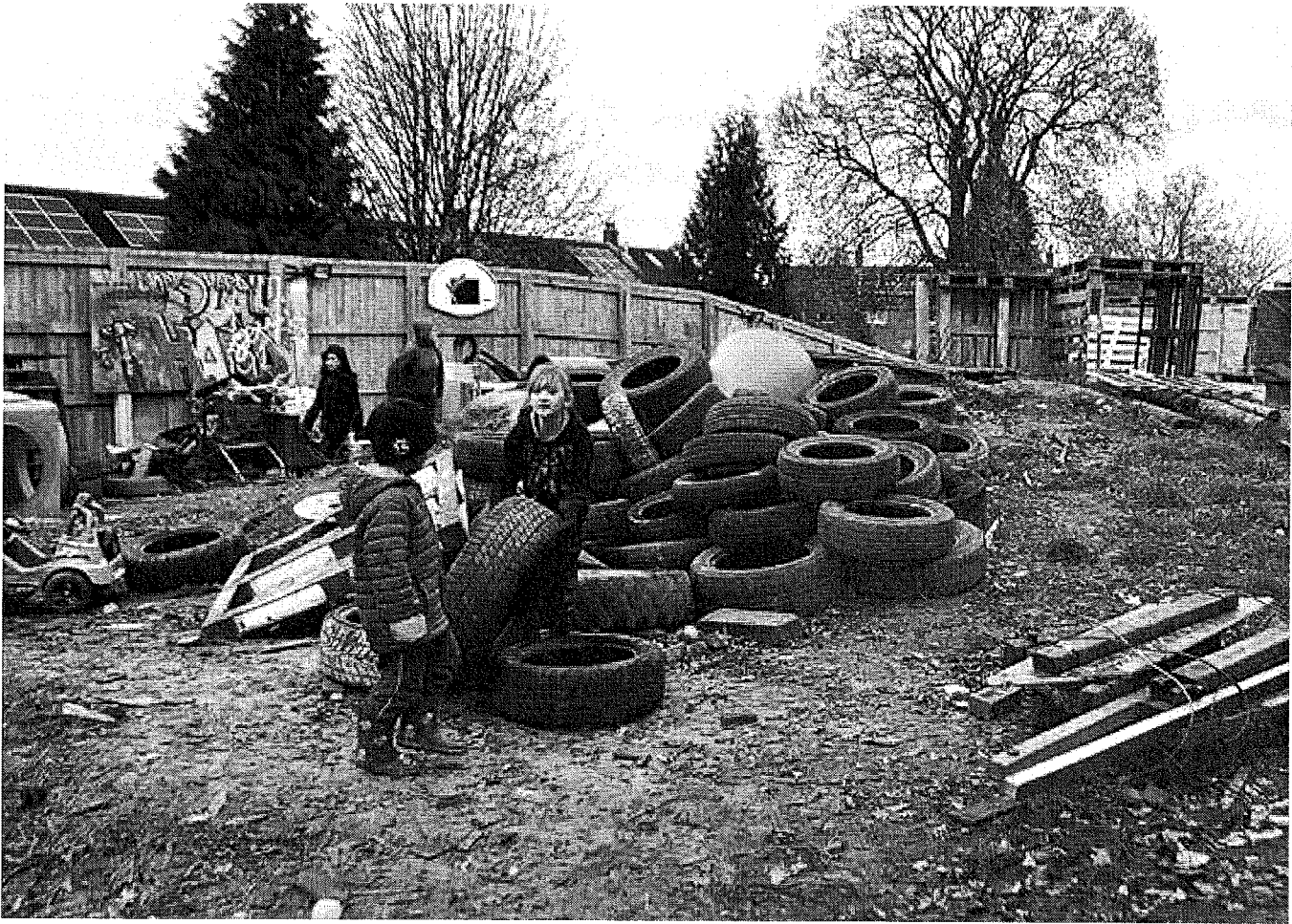
At the Land playground, adult “playworkers” watch over the children, but rarely intervene. (Hanna Rosin)

One common concern of parents these days is that children grow up too fast. But sometimes it seems as if children don't get the space to grow up at all; they just become adept at mimicking the habits of adulthood. As Hart's research shows, children used to gradually take on responsibilities, year by year. They crossed the road, went to the store; eventually some of them got small neighborhood jobs. Their pride was wrapped up in competence and independence, which grew as they tried and mastered activities they hadn't known how to do the previous year. But these days, middle-class children, at least, skip these milestones. They spend a lot of time in the company of adults, so they can talk and think like them, but they never build up the confidence to be truly independent and self-reliant.